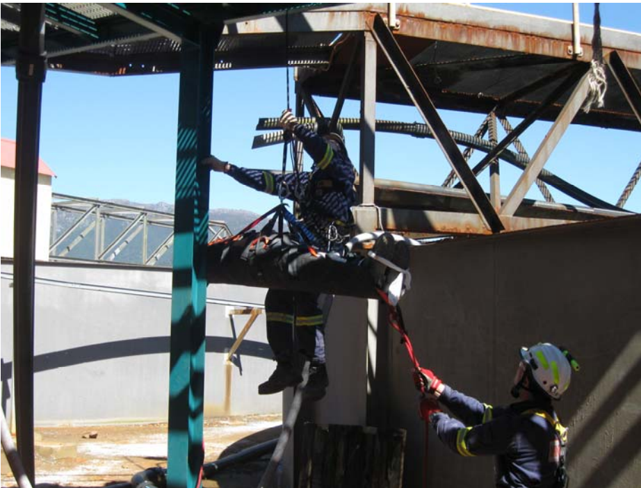
Rope rescue challenge