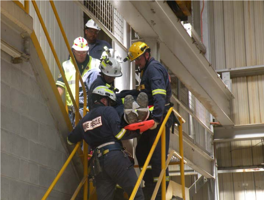
Transporting the patient in the first aid challenge.